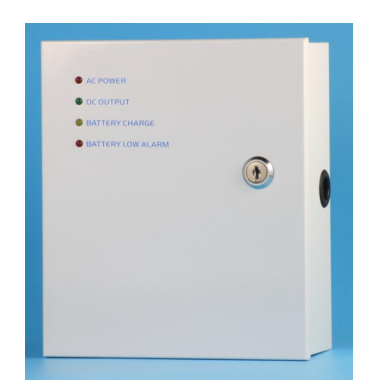
L=22cm W=19.5cm H=8cm